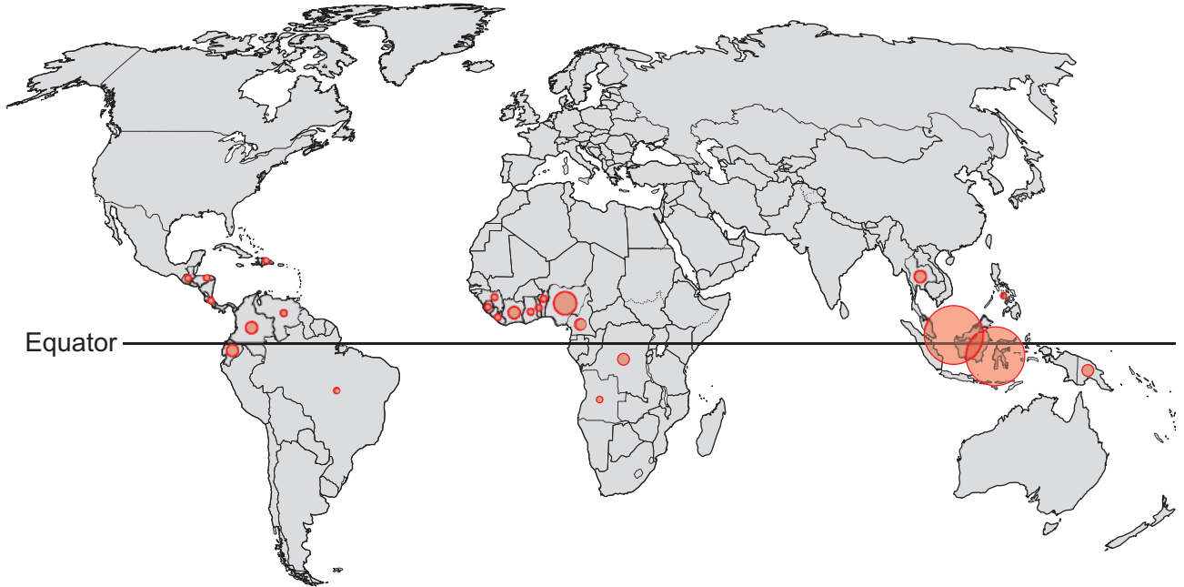
Fig. 1.2 2014